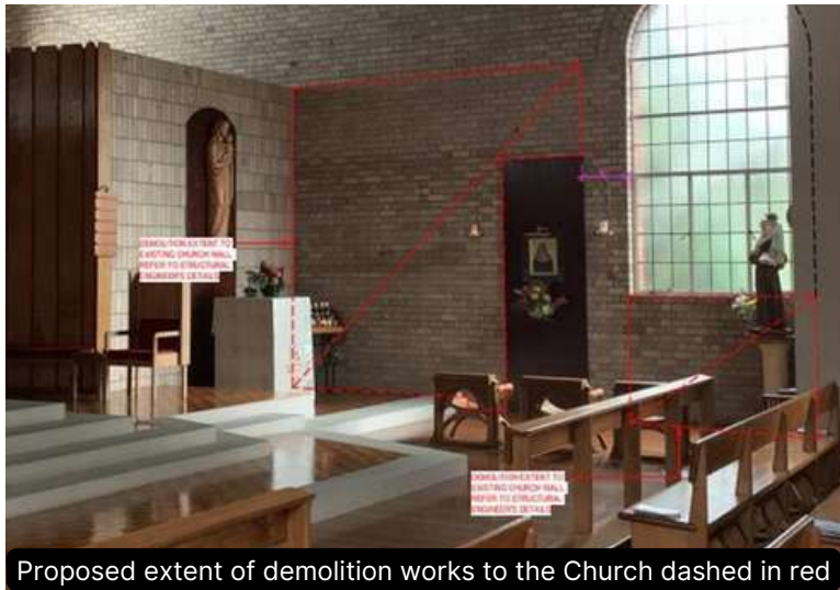
Proposed extent of demolition works to the Church dashed in red