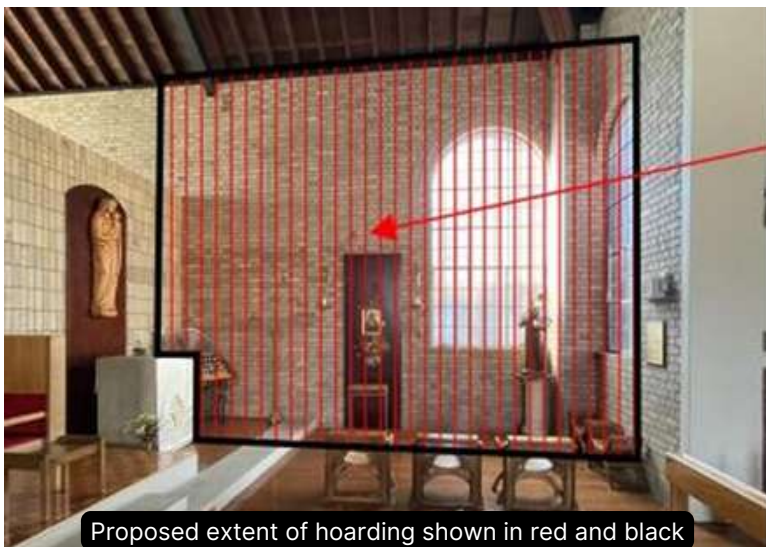
Proposed extent of hoarding shown in red and black