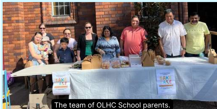
The team of OLHC School parents.

The children had a lovely time – lots of giggling and playing amongst all the eating. Thank you for the support!